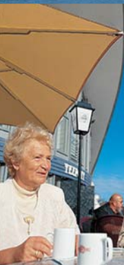
There are street cafés all over Warnemünde.