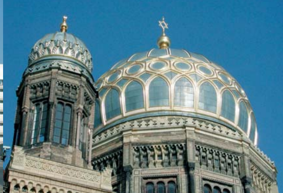
The Jewish Museum is one of Berlin's most popular new cultural attractions.