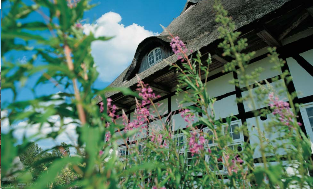
Many houses in the region are still roofed with reeds, a tradition that has lasted for generations.

church and a crooked windmill, right in the middle of thatched-roof farm houses, ancient barns and restored stalls you'll find yourself in a colorful farmer's and herbal garden along with geese, chickens, pigs and horses. On certain days bread is baked as it was in the old days, and music is played on old instruments. And of course, the restaurant's menu features mostly local specialties.