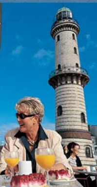
Nearly every restaurant has freshly-caught fish on offer.