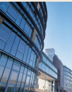
The shipping company AIDA Cruises shows its colors in Rostock.