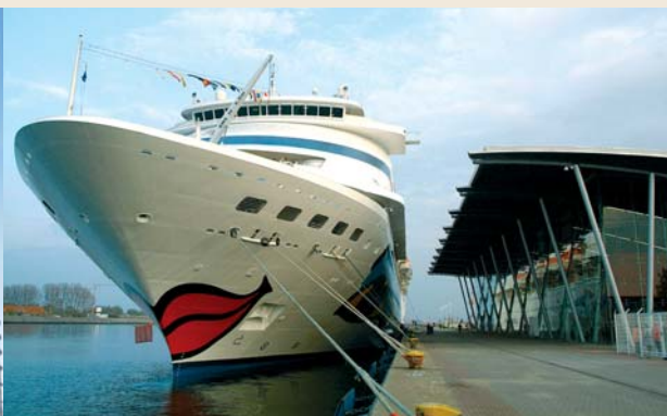
The new passengers' terminal provides for the disembarkation and embarkation of 2,500 passengers a day.