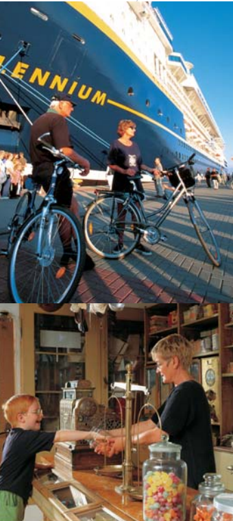
Local residents maintain their traditions with much dedication and energy.

► In the footsteps of the emigrants Old villages and powerful Hanseatic towns, graceful landscapes and images full of yearning