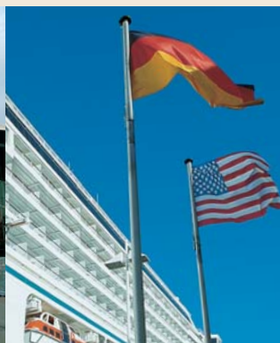
Visitors receive a warm welcome from local residents.

Previous stop-over calls ▶▶ Carnival Corporation (Holland America Line, Cunard Line, P&O, Princess Cruises) with the Noordam, Oosterdam, Rotterdam, Westerdam, Prinsendam, Amsterdam, Caronia, Queen Elizabeth II, Aurora, Arcadia, Oriana, Grand Princess and Star Princess ▶▶ Royal Caribbean Cruises Ltd. and Celebrity Cruises with the Jewel of the Seas, Constellation and Millennium ▶▶ Radisson Seven Seas with the Seven Seas Voyager and Song of Flower ▶▶ Crystal Cruises with the Crystal Symphony ▶▶ Norwegian Cruise Line with the Norwegian Dream and Norwegian Jewel ▶▶ Seabourn Cruise Line with the Seabourn Pride ▶▶ Oceania Cruises with the Regatta and Insignia ▶▶ Fred Olsen Cruise Line with the Black Watch and Braemar ▶▶ Hapag Lloyd with the Europa ▶▶ MSC with the Rhapsody to name but a few