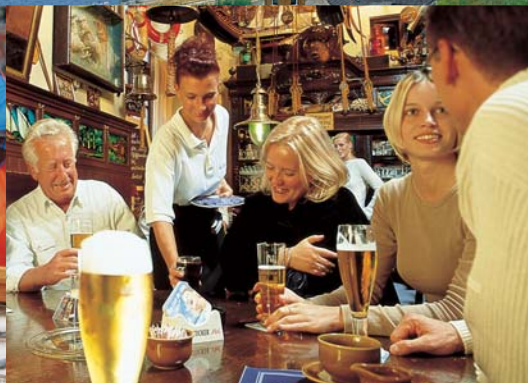
Many a yachtsman holds this hospitable harbor in high regard.