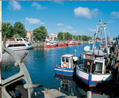
Many an exhilarating sailing trip starts out in Warnemünde's yacht harbor.